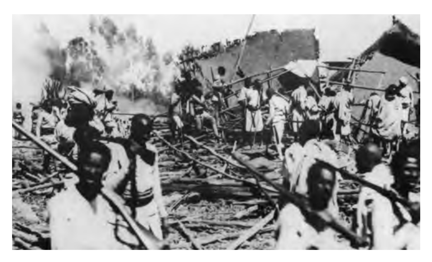
An Abyssinian village bombed by Italian aircraft in the invasion of 1936.

6 Study the photograph, and then answer the questions which follow.